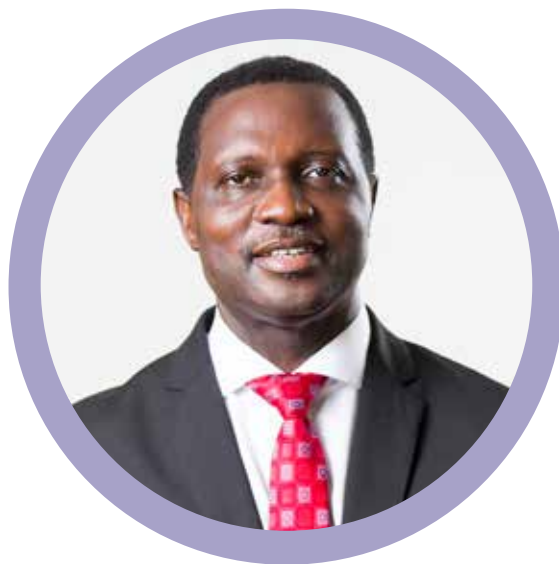
HON. DR. YAW OSEI ADUTWUM